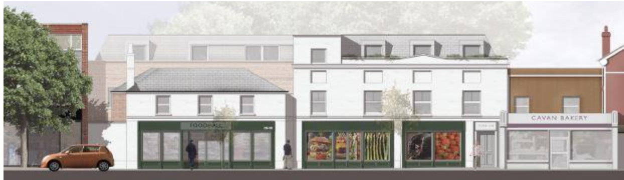
179 Hampton Hill

**GROUND FLOOR AREA 474.36 sq.m (5,106 sq ft) – CAPABLE OF SUBDIVISION**